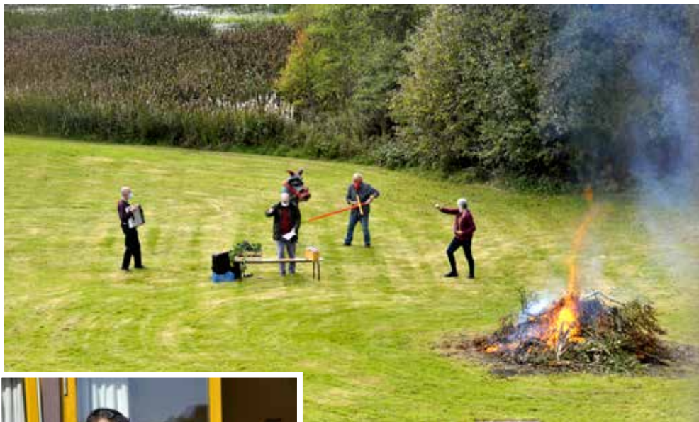
St. Michaelmas celebrated outside with social distancing between the houses.